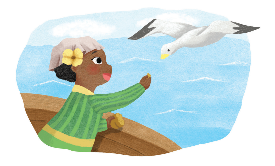
... and bad days. "Fish, again?!"